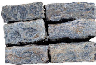
Granite Street Pavers