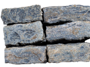
Granite Street Pavers