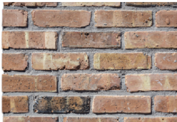
Milwaukee Cream City